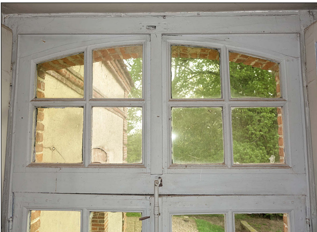
Fig. 2.3. Imposte