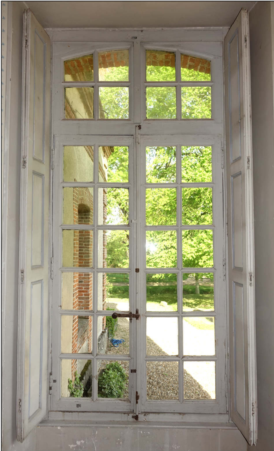
Fig. 2.1. Elévation intérieure (volets ouverts)